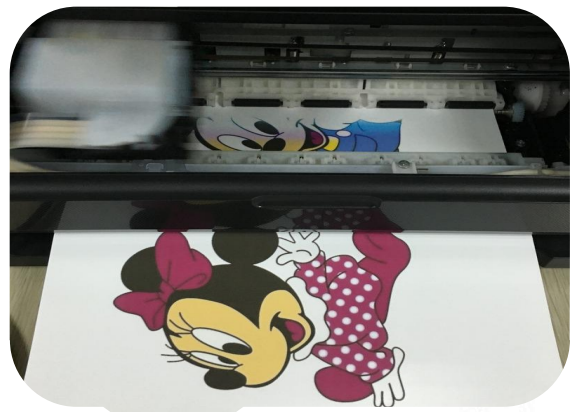
Printer set 'photo quality', 'high quality printing'