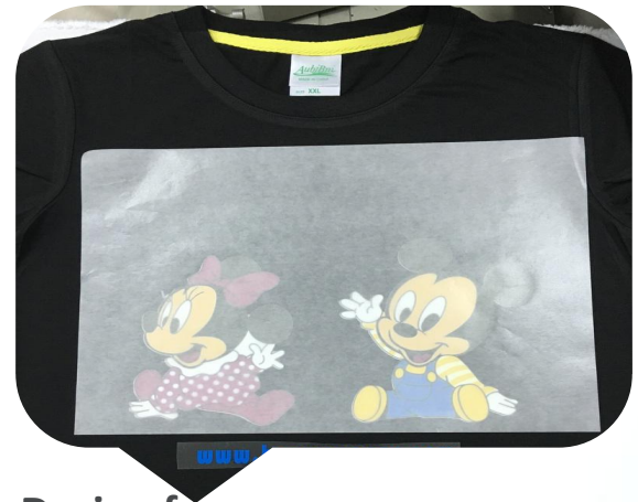
Design face-up, cover an isolation paper