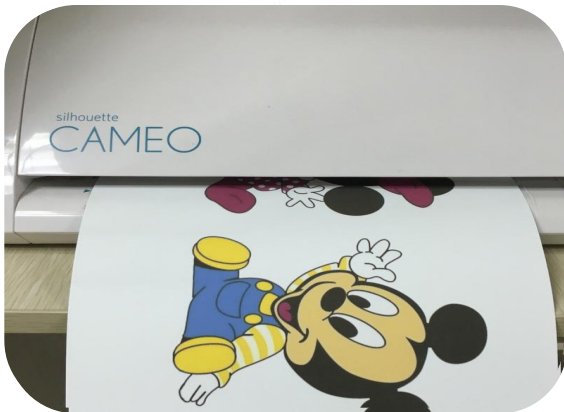
Cut on Silhouette CAMEO plotter, Speed: 6cm/s, Thickness: 2