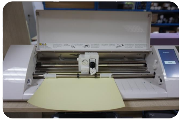
B: plotter working