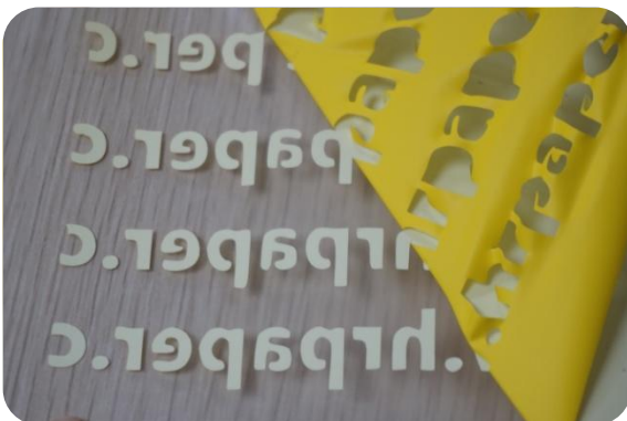
C: Peel off the base paper slowly.