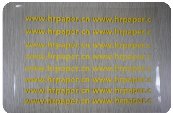
D: Outcome after peel off