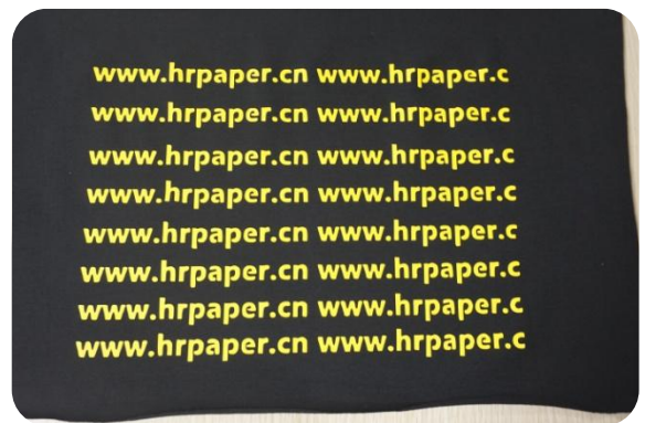
H: The result, bright