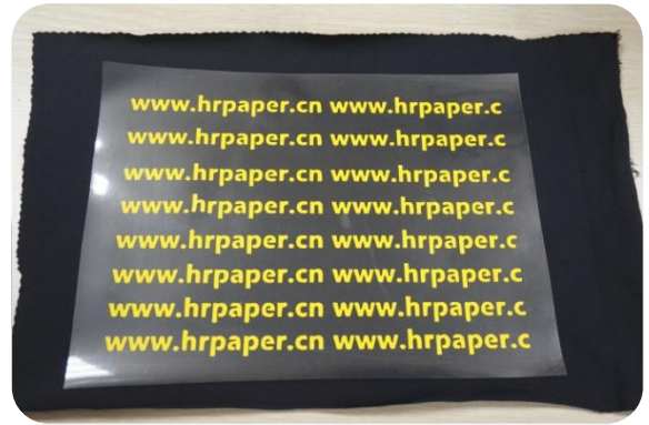
E: Cold peel.