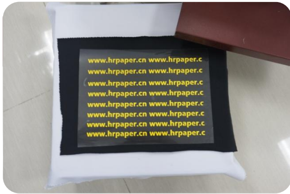
F: Heat press. Temperature 165centigrade; Transfer time: 20seconds