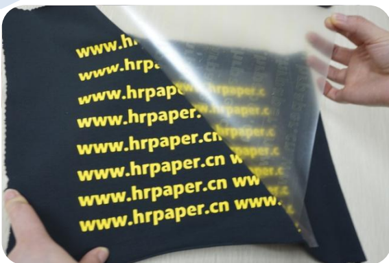
G: Cold Peel. Peel slowly.