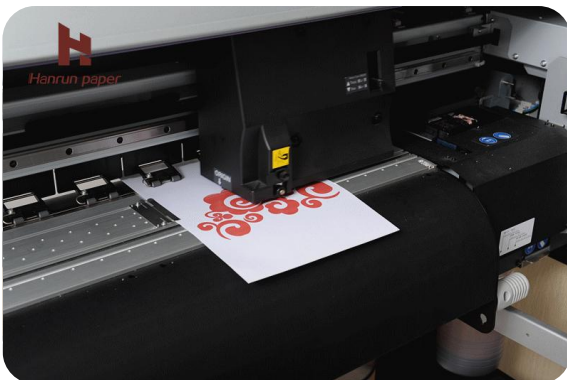
A: Print on Inkjet printer with water based Sublimation ink