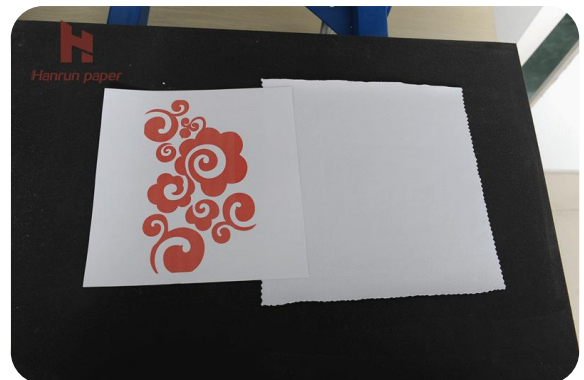
B: Transfer on heat press machine, 190°C, 12-15S